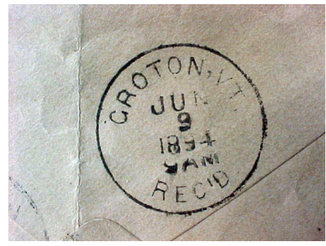
1894 Westville, VT (West Groton) Postmark, right Groton Postmark. Note it was rec'd in Groton the same day it was mailed from Westville without going to White River for sorting.